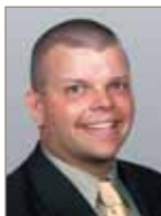
Matt May Team Photographer